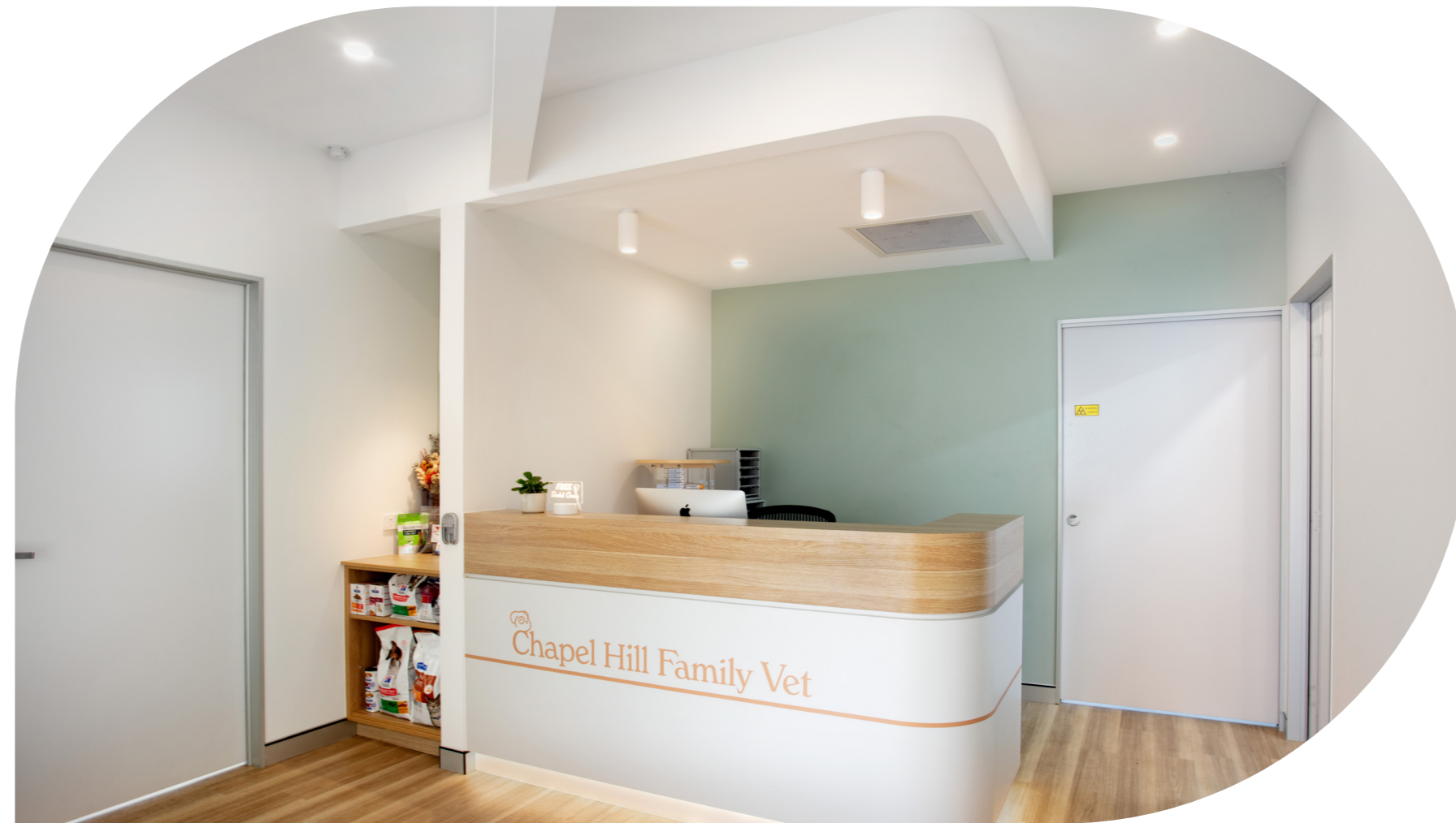
PHOTOGRAPH// Photo of completed practice