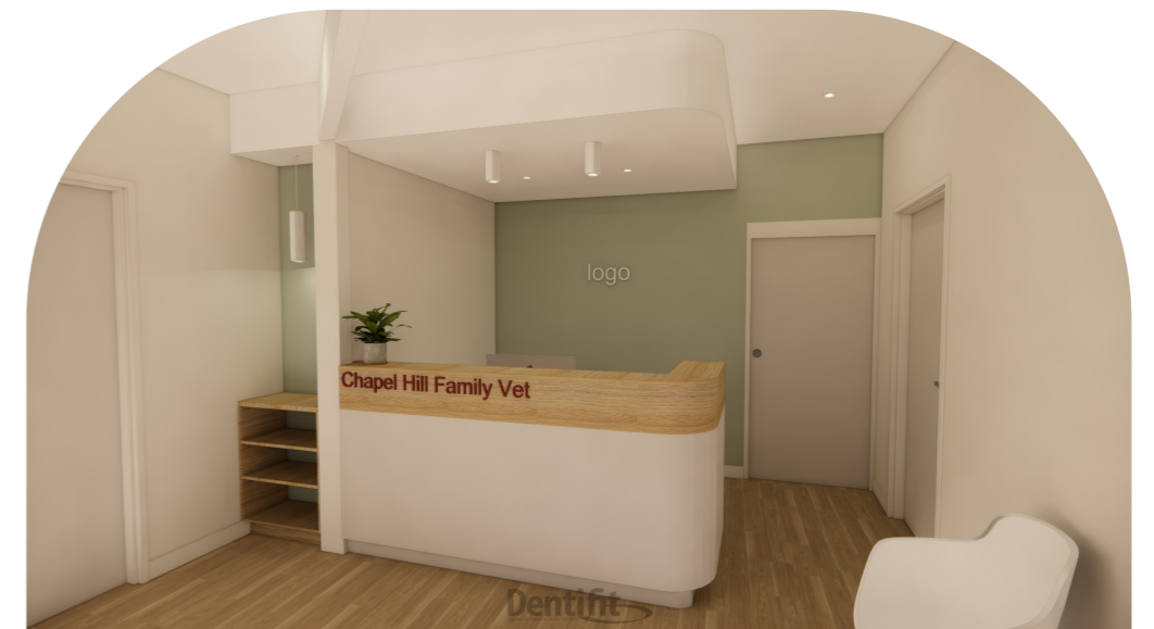
RENDER // computer generated image