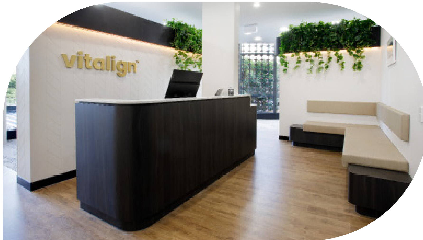
PHOTOGRAPH// Photo of completed practice