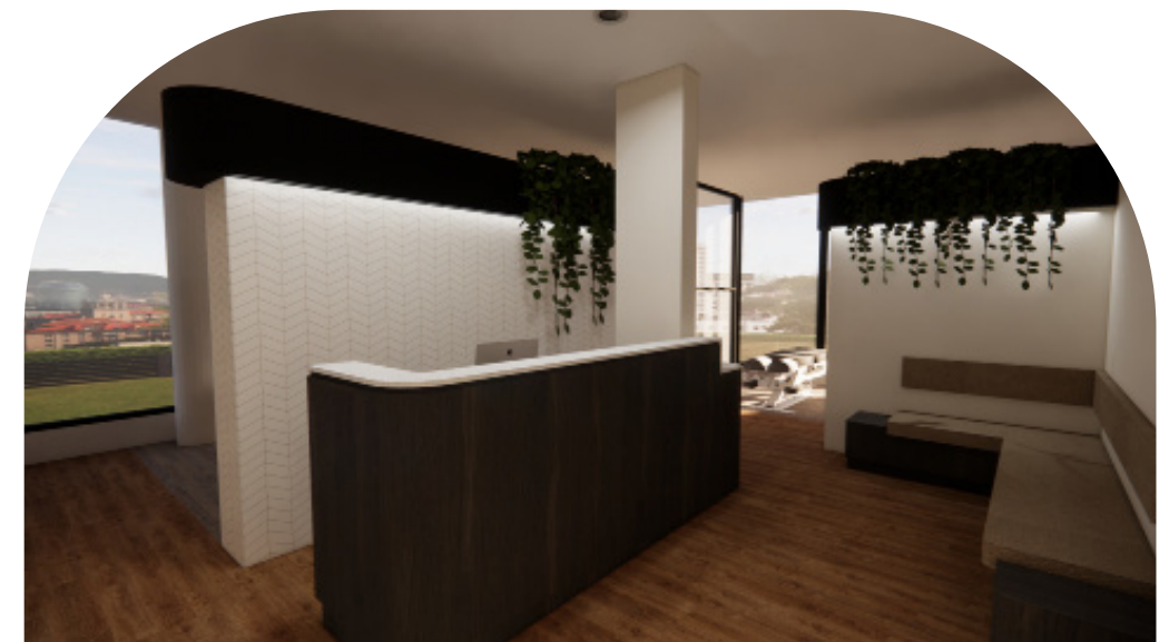
RENDER // computer generated image